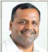
Sh. UT Khader Hon. Speaker of Karnataka