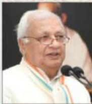
Sh. Arif Mohammad Khan HH Governor of Kerala