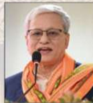
Sh. Jishnu Dev Barman HH Governor of Telangana