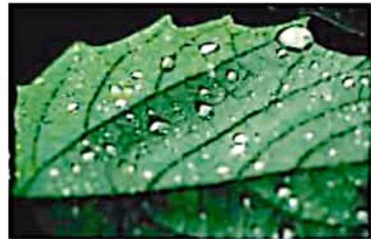
Fig. 2.2 Droplets of water intercepted by tree leaf (photo: M. Marzot (FAO)).

Vegetation also affects infiltration, see Figure 2.2. For instance, infiltration is higher for soils under forest vegetation than bare soils. Tree roots loosen and provide conduits through which water can enter the soil. Foliage and surface litter reduce the impact of falling rain keeping soil passages from becoming sealed.